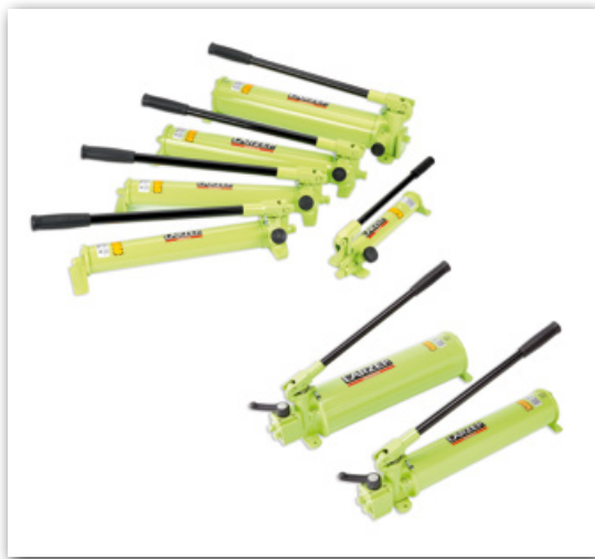
Hydraulic Steel Hand Pumps W-Series and X-Series.